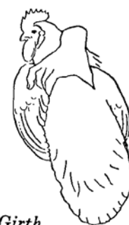
Heart Girth Figure 2)

body to the keel bone in front and in back to the legs. To measure heart girth, turn bird on her side, back toward you, with your thumb on the back near the juncture of the wings and body and your middle finger on the front of the keel. The heart girth should be deep allowing plenty of room for the heart and lungs.