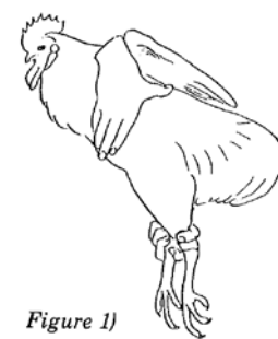
Figure 1) Body Depth

development, which is needed for quick digestion and absorption of food necessary for good egg production. Body depth can be determined by placing your thumb on the hip bone and spanning with your hand and fingers the side of the